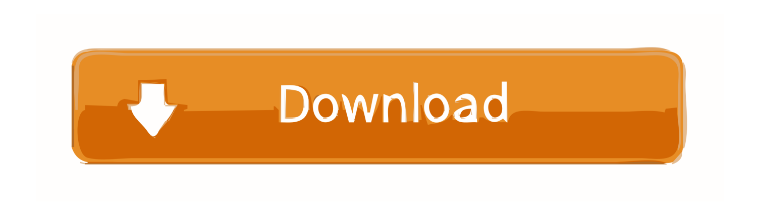
Matlab 2010a License Standalone.dat